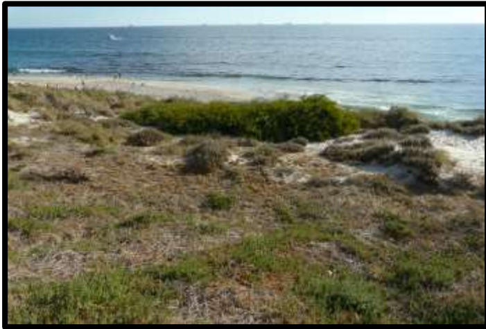
Prior to activity