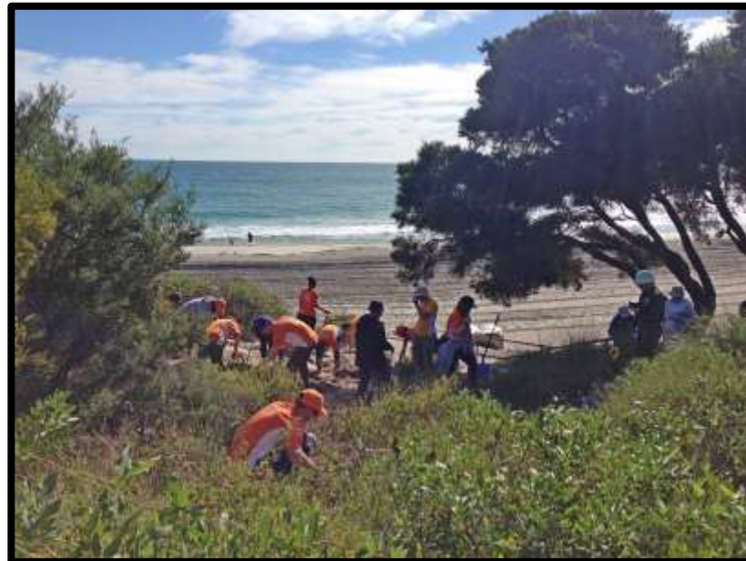
Bankwest team planting at Muderup