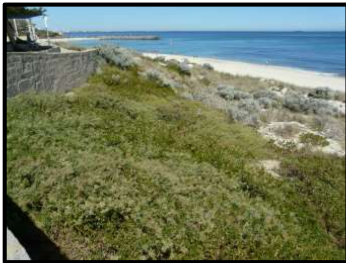
After 3 years